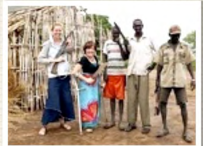
we got to hold ak's for fun