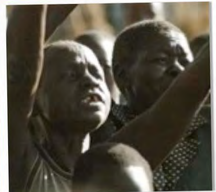
HUNGRY FOR HIM!