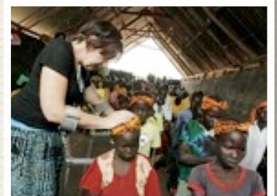
blessing the children