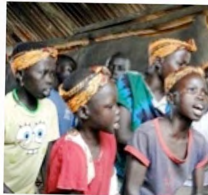
OUR CHILDREN WORSHIPPING