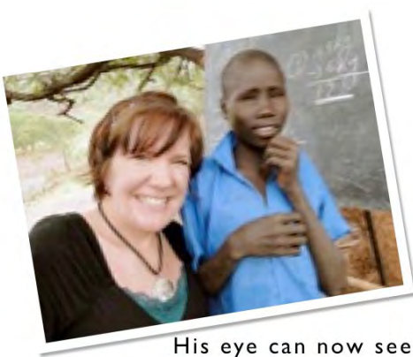
His eye can now see!!!!