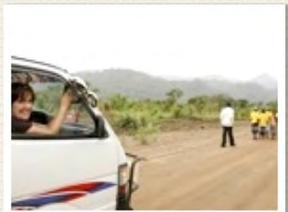
a long trip WELL worth the ride