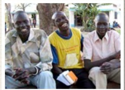
Some of our Eastern key leaders