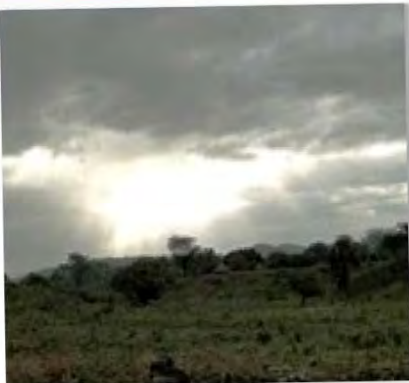
OPEN HEAVEN WELCOME